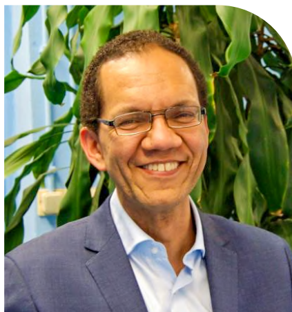
PROF. STANLEY BRUL

The Fight for a Healthy Planet: The Role of Women in Food Security in Africa”